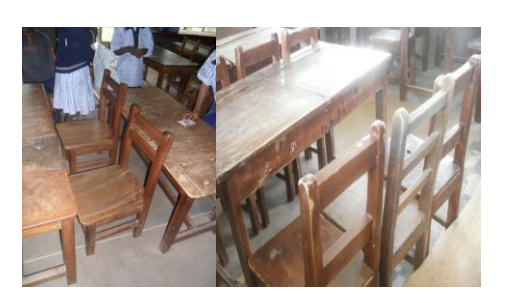
Plate 1. SU chair and MU Desk in staff school

International Journal of Scientific & Engineering Research, Volume 3, Issue 9, September-2012 ISSN 2229-5518